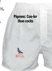
Pigeons: Cooler than cocks

When we Googled 'pigeon + boxer', this is what came up (right). We're not sure which is more pants: novelty underwear, or the fact that a violent rapist has been given his own telly show. Does Tyson deserve a second chance, or do you hope the pigeons shit on his head? Get involved with the debate at Yourbizarre.com